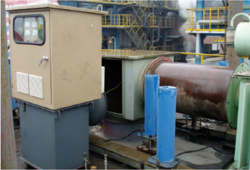
Figure 2 High-frequency power supply in the site test